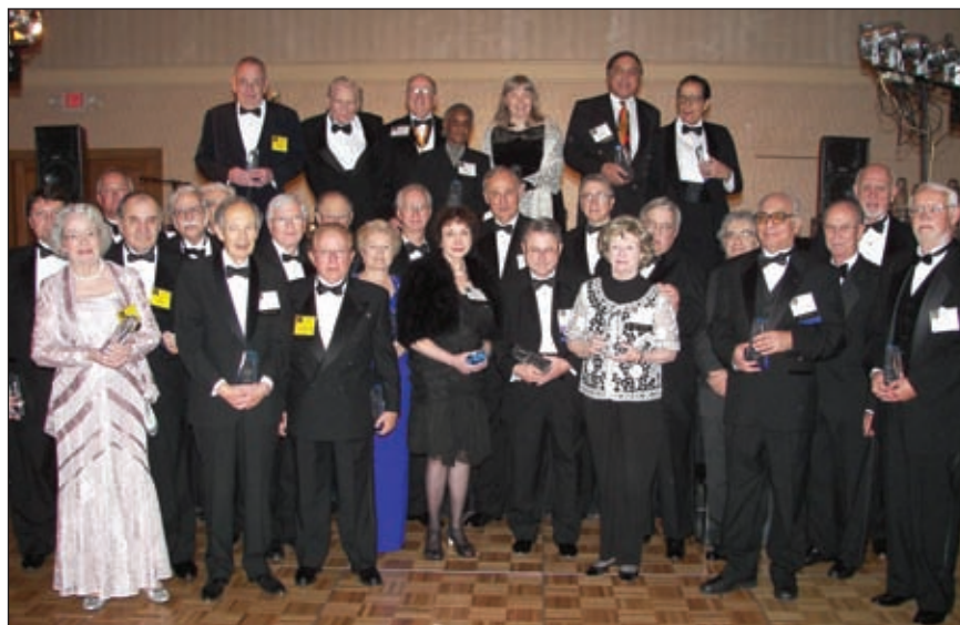
Former Award Recipients Attending TSPP's 50th Awards Gala

AWARDS RECEPTION, BANQUET AND GALA — We invite you to join us for the 2011 Awards Reception and Awards Banquet honoring this year's outstanding Award recipients, as well as all TSPP Past Presidents and former Award recipients. Immediately following the awards presentation, TSPP has planned a gala evening of entertainment, conversation and dancing. (See Registration Form for Purchasing Reserved Table(s) for your Group and/or Organization. NOTE: Reserved Table Fee includes recognition in the 55th Anniversary Program, online and in on-site signage.)