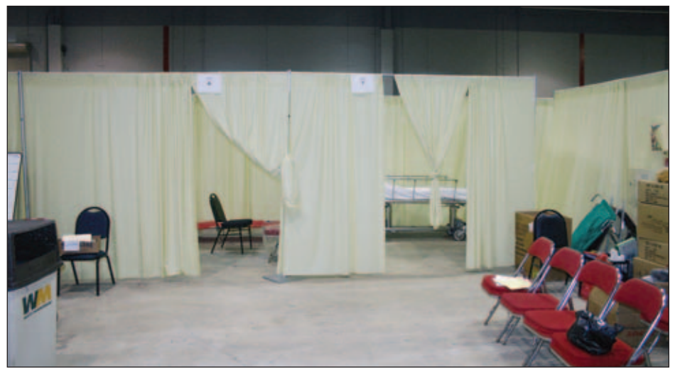
Psychiatric clinic at the AstroArena