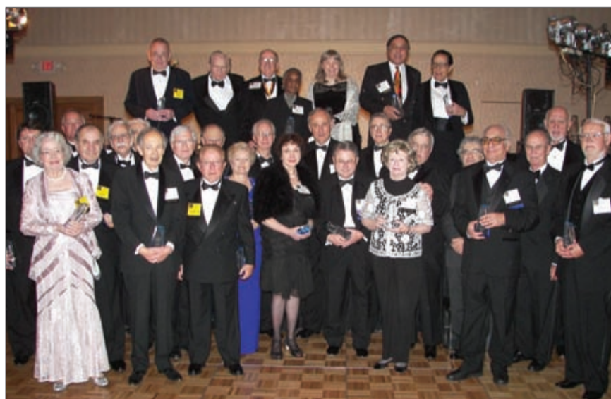
Former Award Recipients Attending TSPP's 50th Awards Gala

AWARDS RECEPTION, BANQUET AND GALA — We invite you to join us for the 2011 Awards Reception and Awards Banquet honoring this year's outstanding Award recipients, as well as all TSPP Past Presidents and former Award recipients. Immediately following the awards presentation, TSPP has planned a gala evening of entertainment, conversation and dancing. (See Registration Form for Purchasing Reserved Table(s) for your Group and/or Organization. NOTE: Reserved Table Fee includes recognition in the 55th Anniversary Program, online and in on-site signage. )