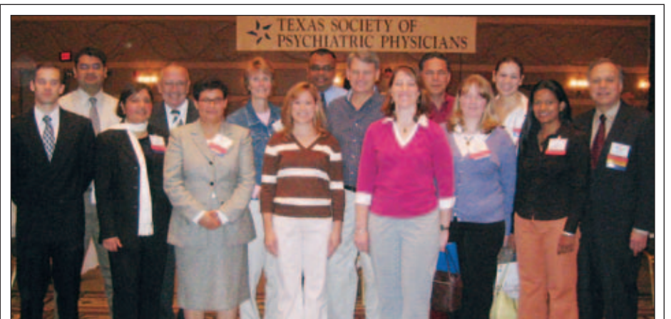
The 2005 TSPP Annual Convention and Scientific Program conducted in Austin on November 4-6 was a big success with almost 300 members and guests in attendance, including Residents and Training Directors pictured above. For more Scenes from the Annual Convention, see page 8.