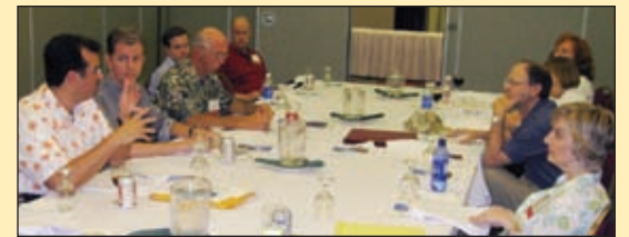
TSCAP Executive Committee at work