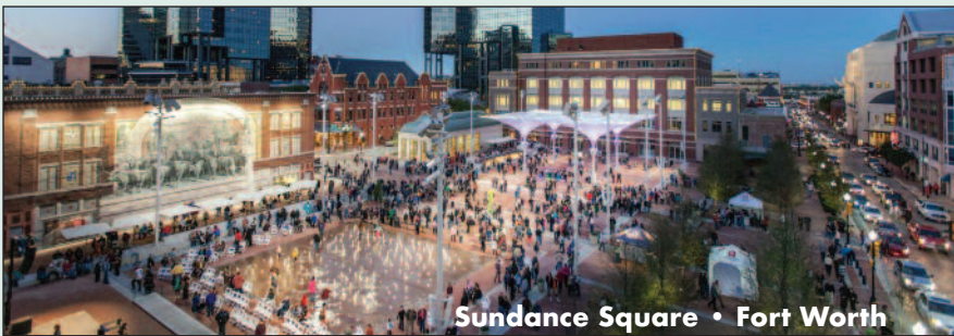
Sundance Square • Fort Worth