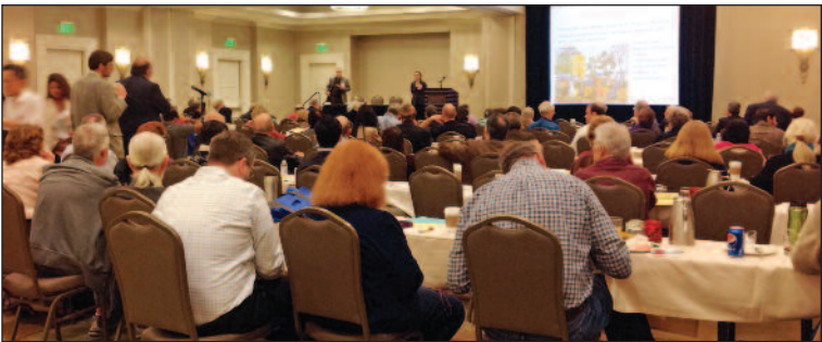
TSPP Scientific Program