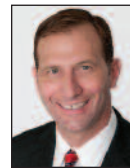
SPECIAL SERVICE Senator Charles Schwertner, MD Georgetown